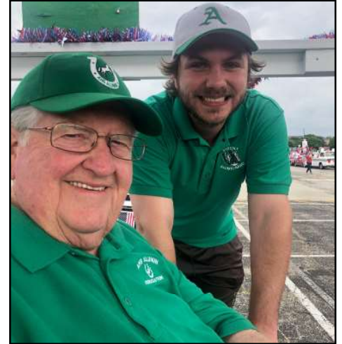
Across the decades, Colts are glad they are AHS Colts!