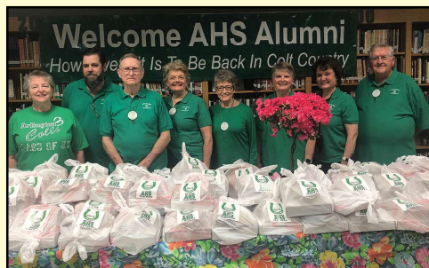
Board hosts teacher appreciation box lunch in May and picnics together after decorating the Fourth of July float.