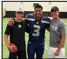
NFL quarterbacks Aaron Rodgers, Patrick Mahomes, Russell Wilson film a commercial in Colt Country!